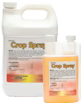
1 gal and 1 qt