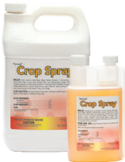
1 gal and 1 qt