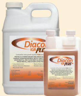
2.5 gal and 1 qt