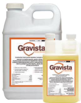
2.5 gal and 1 qt

Central Life Sciences offers numerous combination products featuring grain protectant technology that helps control larval development as well as kills adult insects. Our combination products can add to the knockdown power of an adulticide with the boost of a synergist for challenging infestations and/or the long-term control of an insect growth regulator (IGR), all in a single product. These products are formulated to contain the right ratio of active ingredients to control insects and are a convenient alternative to tank-mixing.