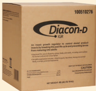
40 lb box

Insect growth regulators (IGRs) disrupt the insect life cycle by interrupting larval development. Diacon® IGR products are tolerance exempt IGRs that can be used everywhere stored product insects are a problem. They can be used on all stored grains, spices, feed and seeds including those used for animal and human consumption. From commercial elevator and on-site farm storage to food processing facilities and everywhere in between, Diacon® IGR products go where insects are to provide LONG-TERM CONTROL AND PROFIT PROTECTION.