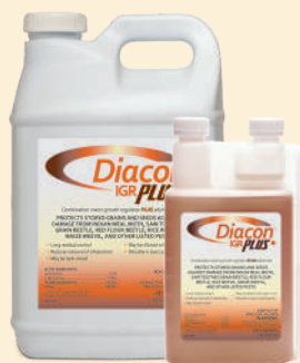
2.5 gal and 1 qt