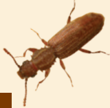
Unprotected Oats Infested with Sawtoothed Grain Beetle