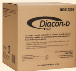
40 lb box

Insect growth regulators (IGRs) disrupt the insect life cycle by interrupting larval development. Diacon® IGR products are tolerance exempt IGRs that can be used everywhere stored product insects are a problem. They can be used on all stored grains, spices, feed and seeds including those used for animal and human consumption. From commercial elevator and on-site farm storage to food processing facilities and everywhere in between, Diacon® IGR products go where insects are to provide LONG-TERM CONTROL AND PROFIT PROTECTION .