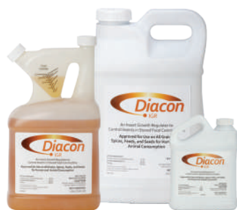
2.5 gal, 1 gal and 1 liter