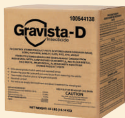
44 lb box