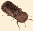
Unprotected Wheat Infested with Lesser Grain Borer